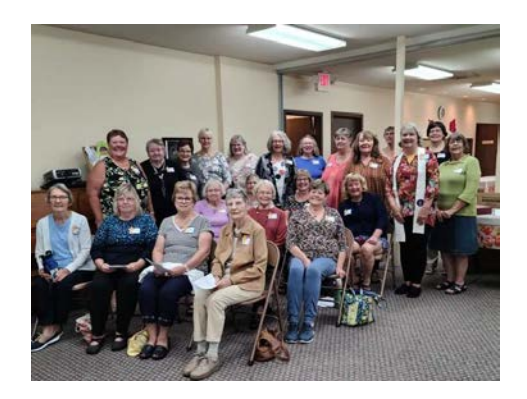
Presbyterian Women's "Fall Workshop