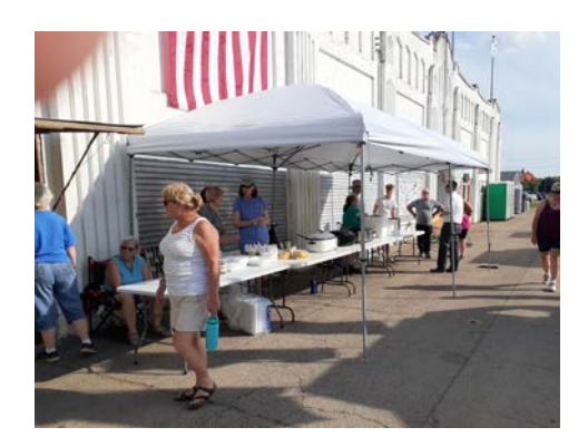
"Meal @ The Fair"