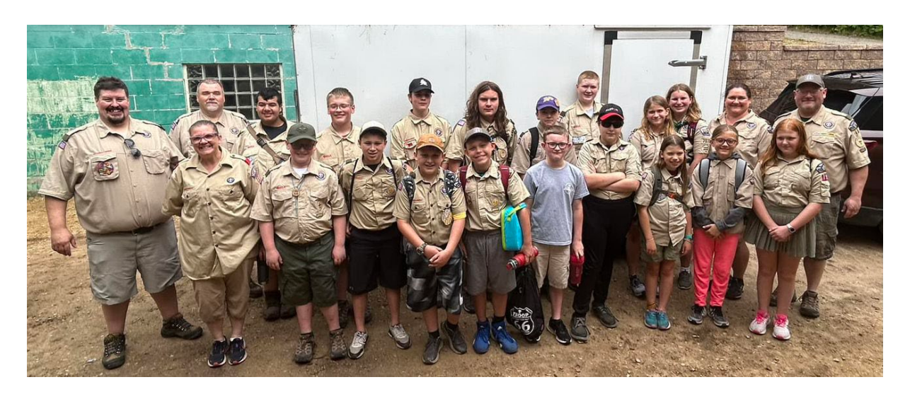
All of PPC's Scout Units have had a busy summer!

And there is some "exciting news" about our Scout units coming up!